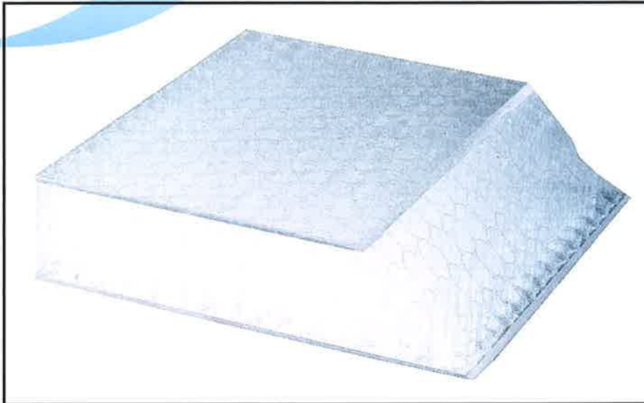
Figure 1: Air-board® UV PC 19